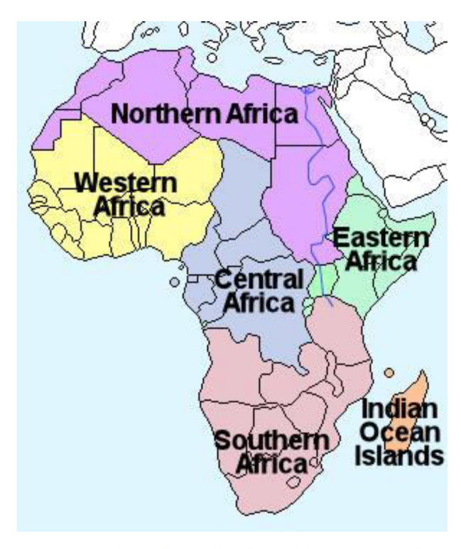
Figure 1. Regions in sub-Saharan Africa